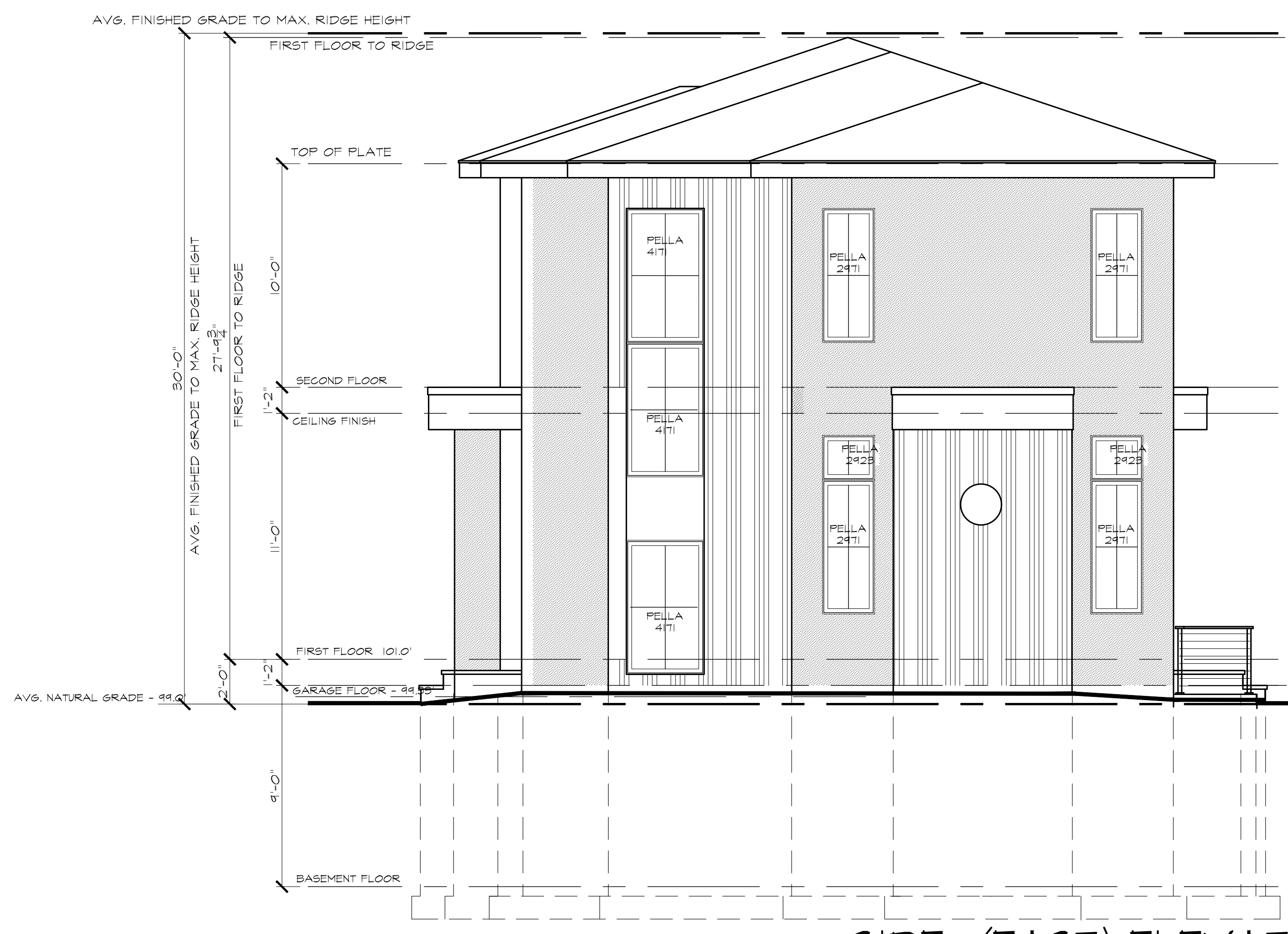
SIDE (EAST) ELEVATION SCALE: 1/4" = 1'-0"