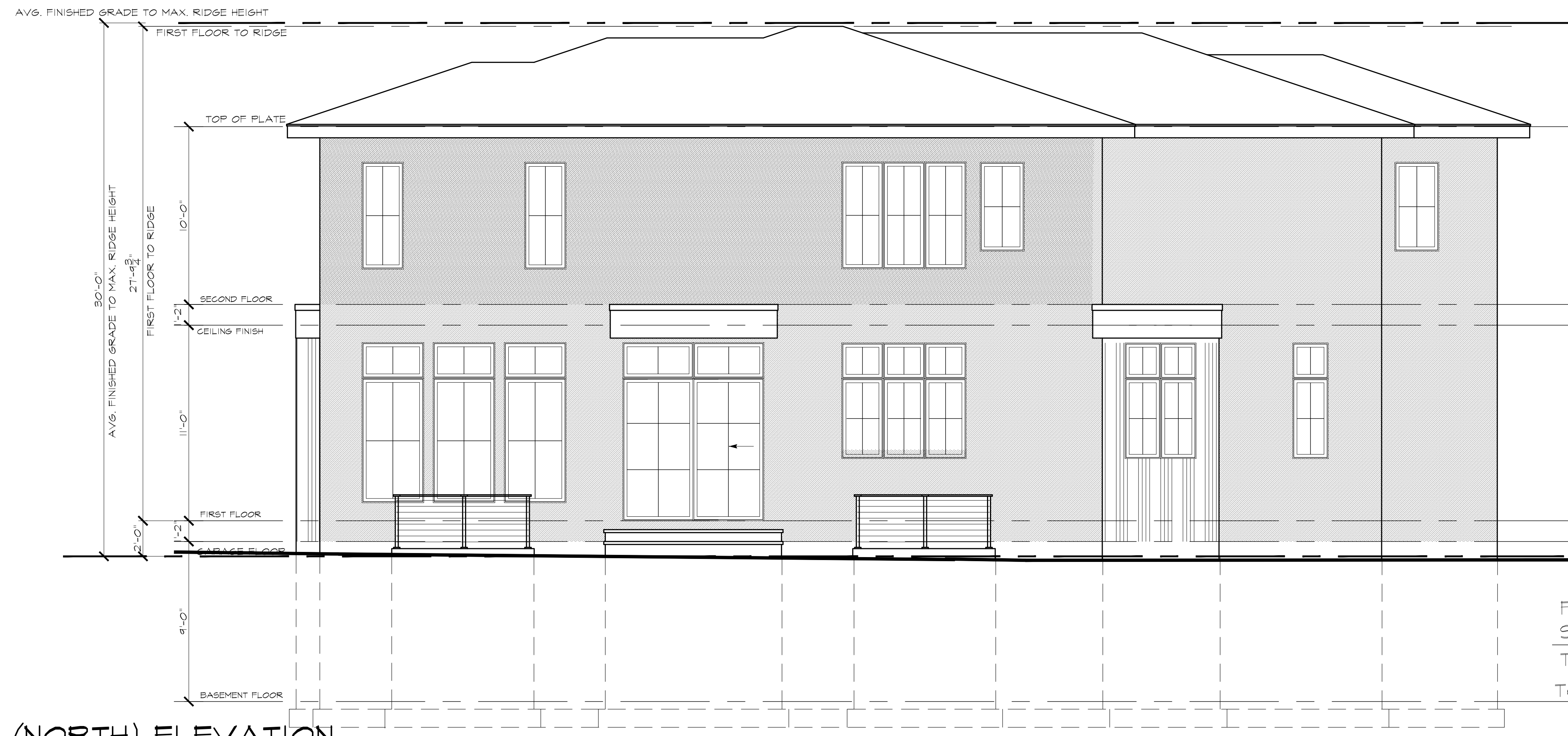
REAR (NORTH) ELEVATION SCALE: 1/4" = 1'-0"

FIRST FLOOR HABITABLE AREA: 1374.1 SF SECOND FLOOR HABITABLE AREA: 1624.2 SF TOTAL FLOOR HABITABLE AREA: 2,998.3 SF TOTAL HABITABLE AREA: \frac{2,998.3}{10,000} SF TOTAL HABITABLE AREA: 29.98 %