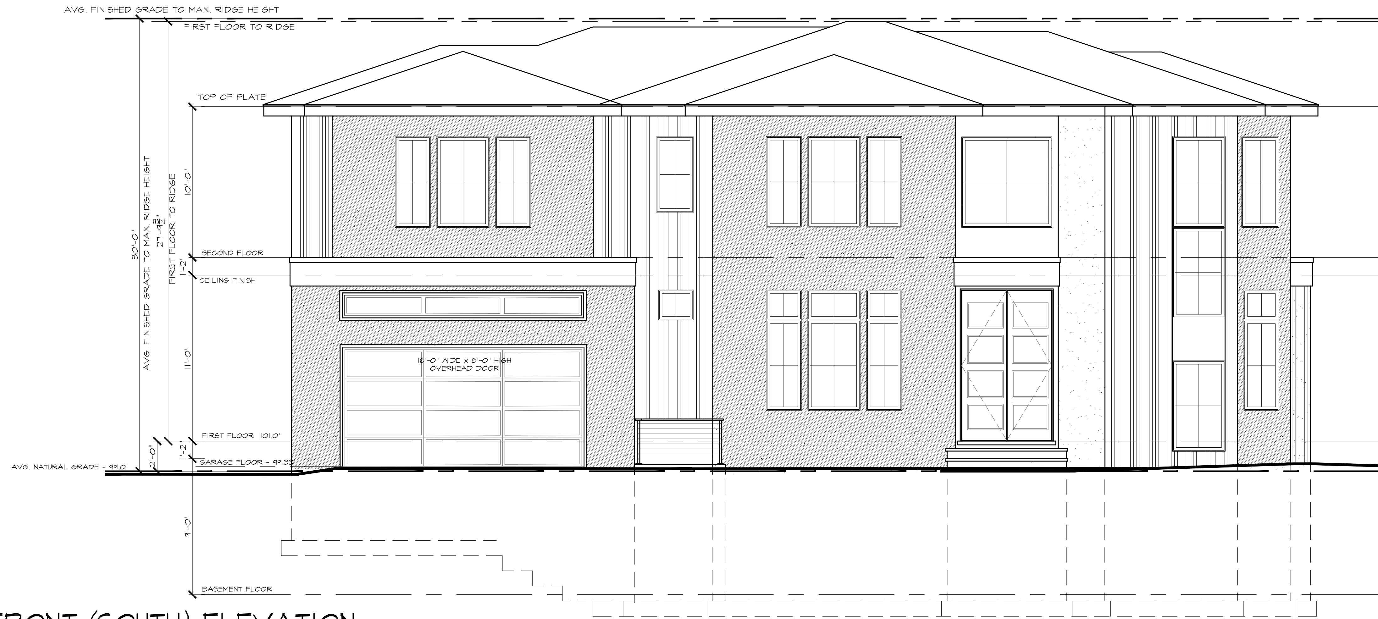
FRONT (SOUTH) ELEVATION SCALE: 1/4" = 1'-0"